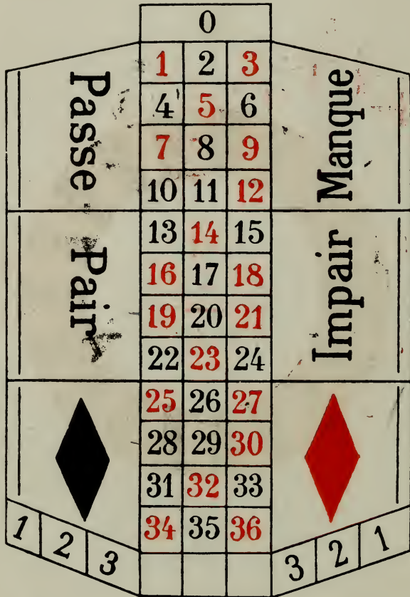
Plan of Roulette table.